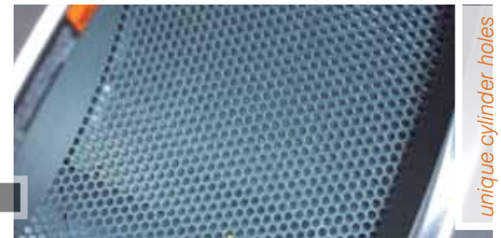
unique cylinder holes