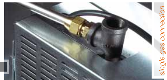
single gas connection