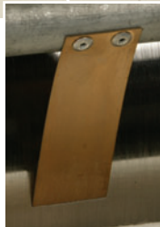
Finished Goods Fingers

Another unique advantage of UniMac is the finished goods fingers . To ensure the linens remove themselves from the heated roll without wrapping around the roll, UniMac installs a row of fingers to keep your finisher running without destroying linens.