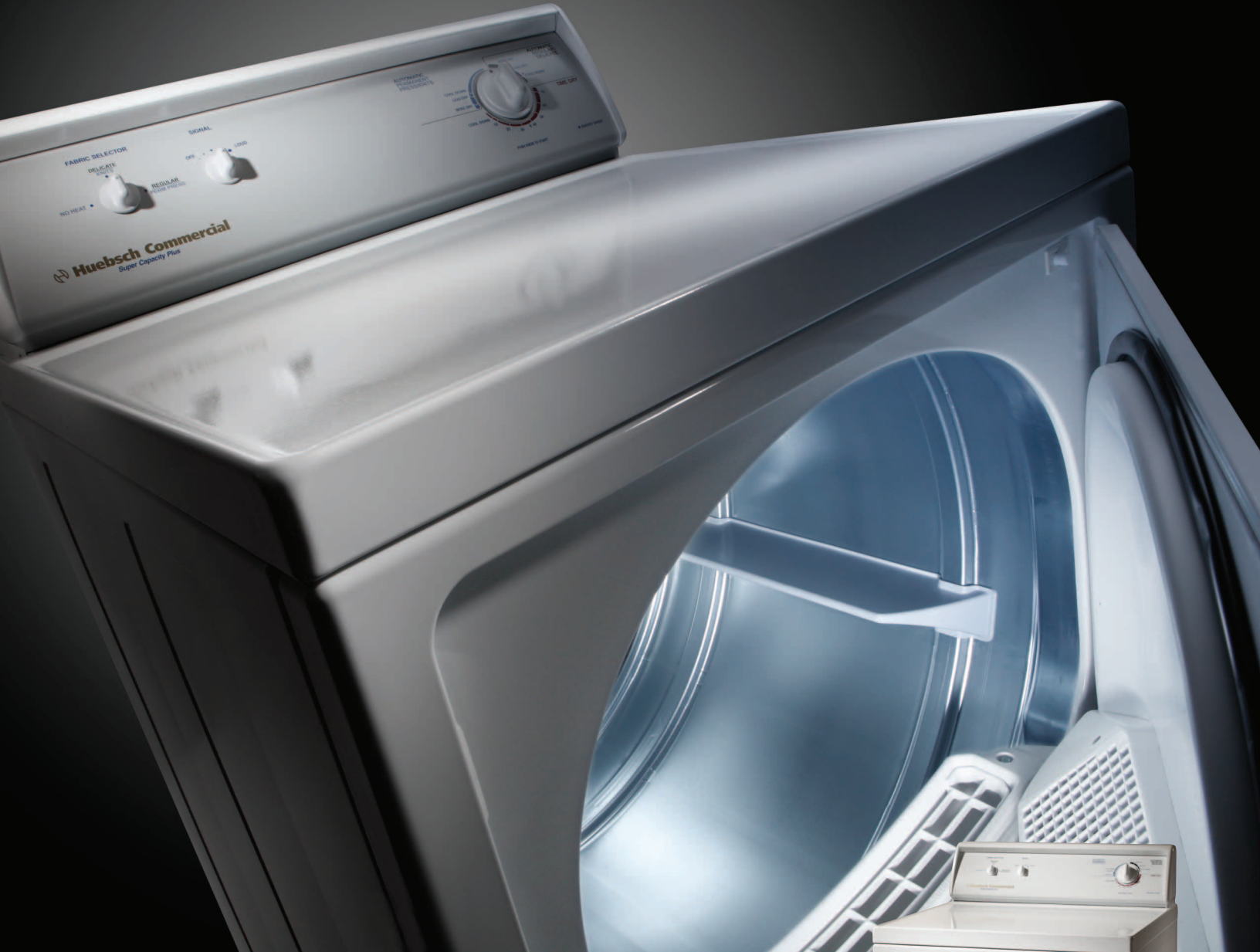
Commercial Homestyle Dryer